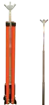
STF1230 - Roll-up Signs

Adding an RUB3315 sign bracket allows the stand to hold roll-up signs that do not have clamps.